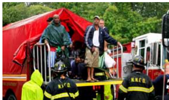
Then NNFD evacuates residents from the Great Oak Apartment complex.

closed, Warwick High School stayed open from noon Saturday the 25th until Monday evening. Deputies with the Newport News Sheriff’s Office provided security around the clock for those 53 hours. They worked in three hour shifts so not to abandon their own family needs at home. A total of 54 residents sought shelter from the rains.